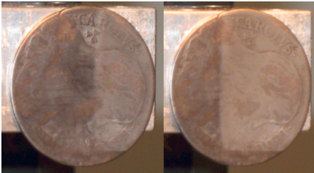
Figure 4. Carlino during laser cleaning.