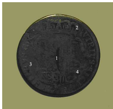
Figure 2. Areas of Carlino coin on which was performed EDXRF analysis.

during the laser cleaning at different laser doses. Figure 3 shows the sulphur concentration vs laser doses for the different treated areas. Figure 4 shows the laser cleaning action on the removing of the tarnished layer due to the contaminations. Experimental results about the laser cleaning of Ag/Cu ancient coin show that the UV pulsed irradiation can be used safely as a powerful tool to remove the sulphur patina from the coin surface. Working below the laser fluence threshold, indeed, the UV laser action is able to reduce the sulphur concentration more than 80%.